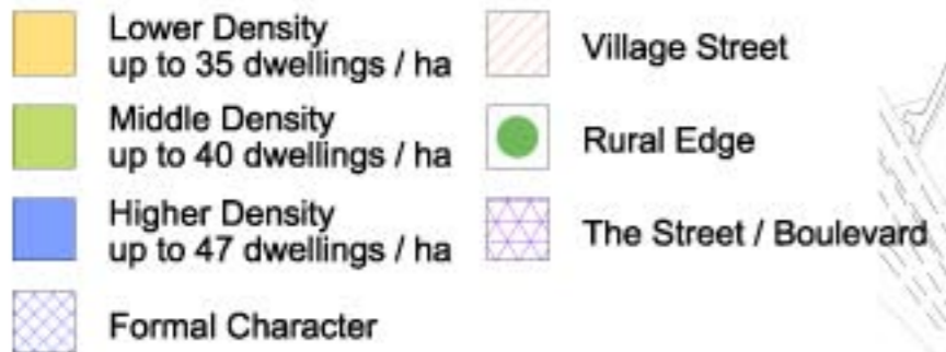
Indicative Urban Design Framework