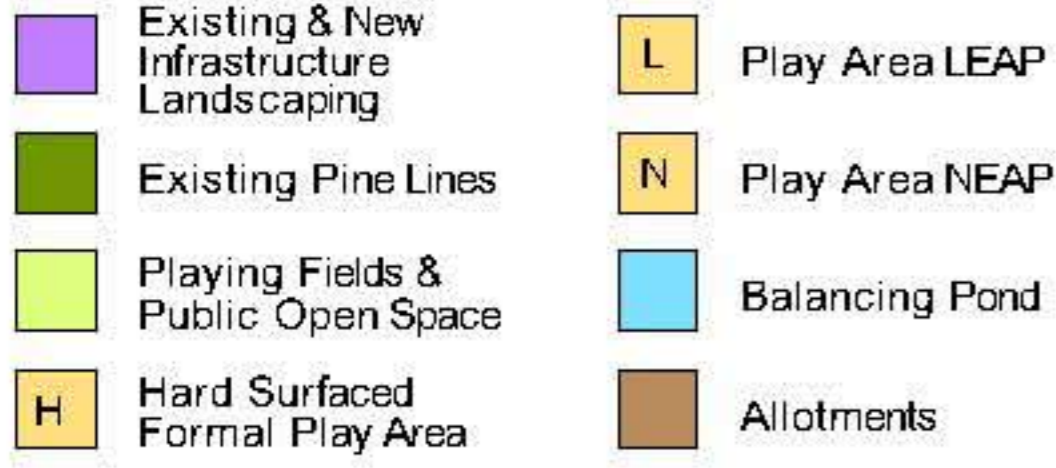
Indicative Landscape Infrastructure